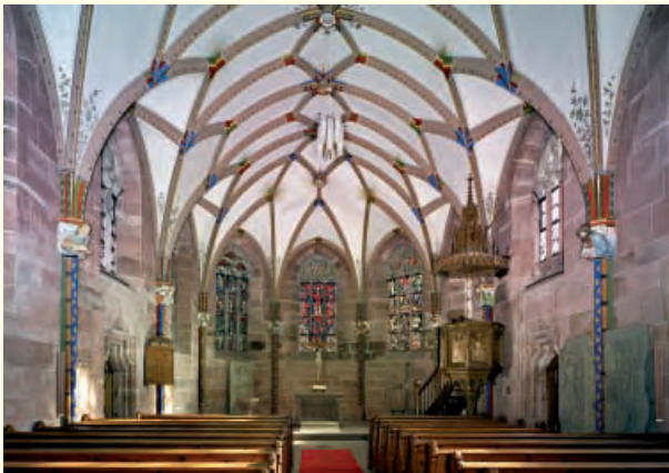
Choir in St. Mary's chapel

The neighbouring monastery of St. Peter and Paul consecrated in 1091 was one of Europe's largest monasteries of the time. The church, built along the lines of Benedictine Reformatory monasteries, was a model for numerous other churches that have their origins here. The enclosure was renovated at the end of the 15th century in the Gothic style.