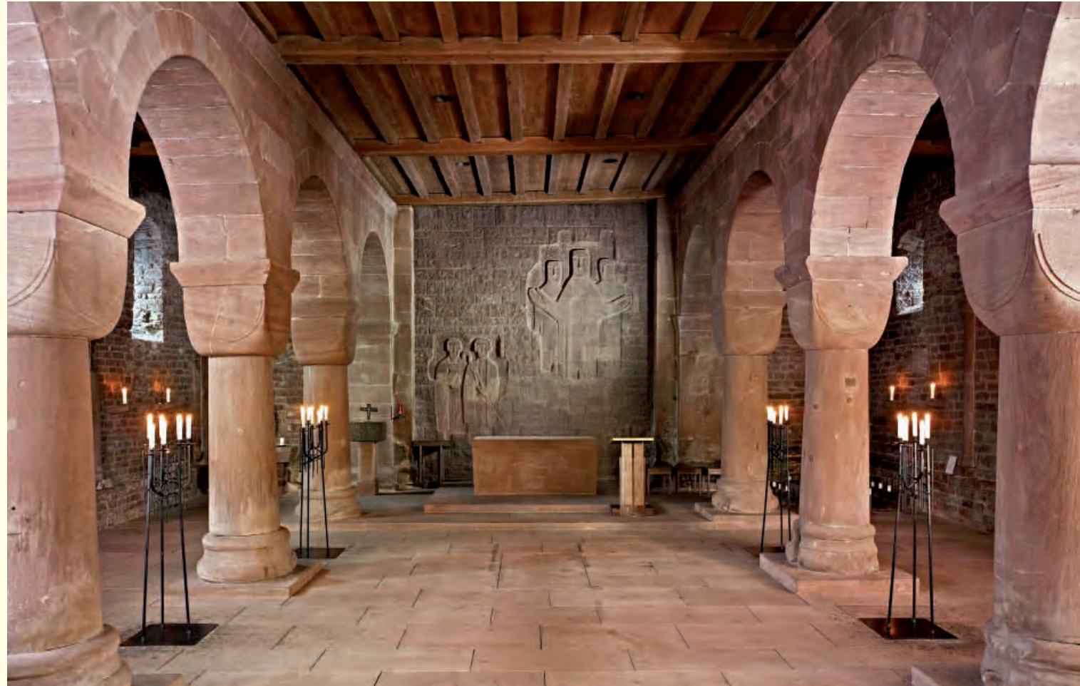
Nave of St. Aurelius' church

After the Reformation and establishment of a protestant monastery-school, the ducal hunting lodge was added to the monastery grounds. A blaze at the end of the 17th century and the demolition of the