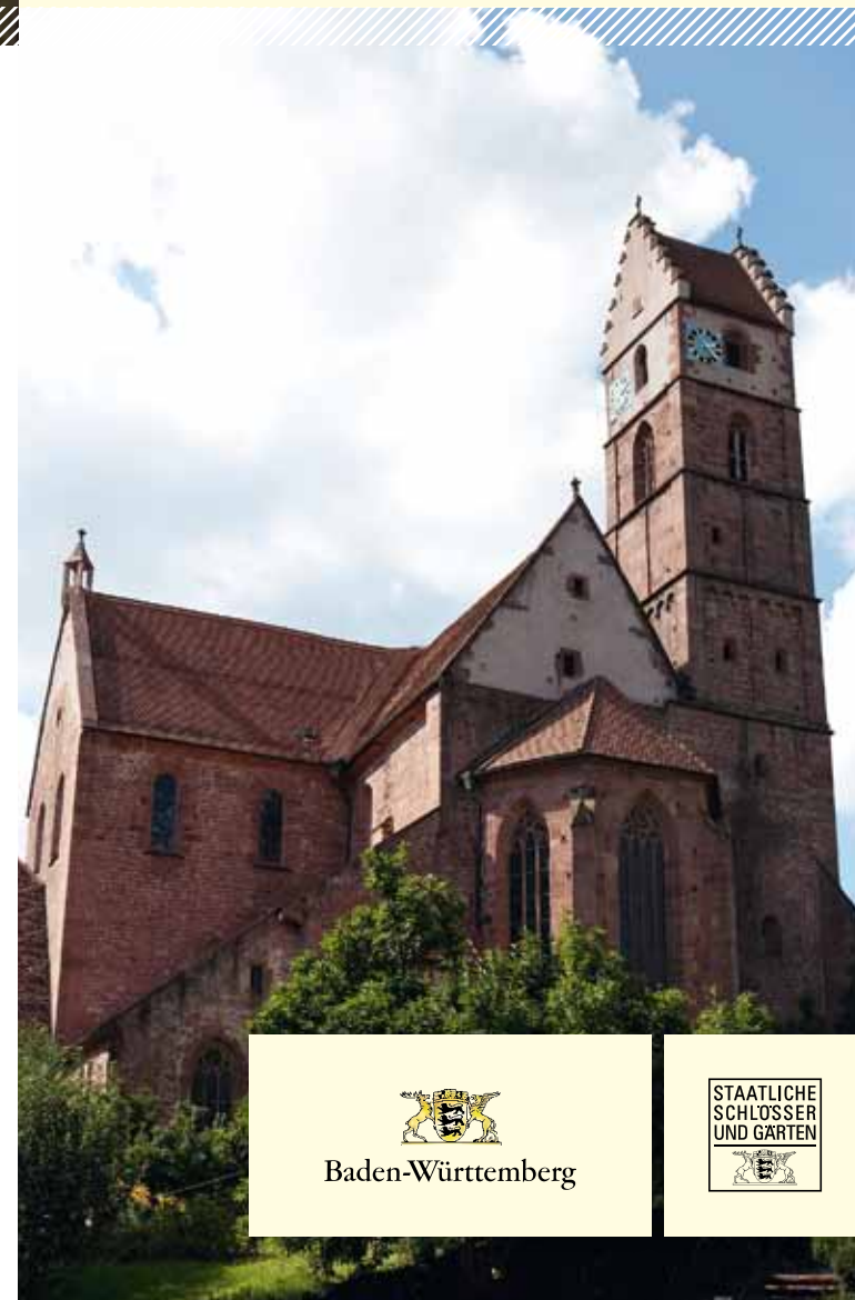
concept and design: www.jungkommunikation.de