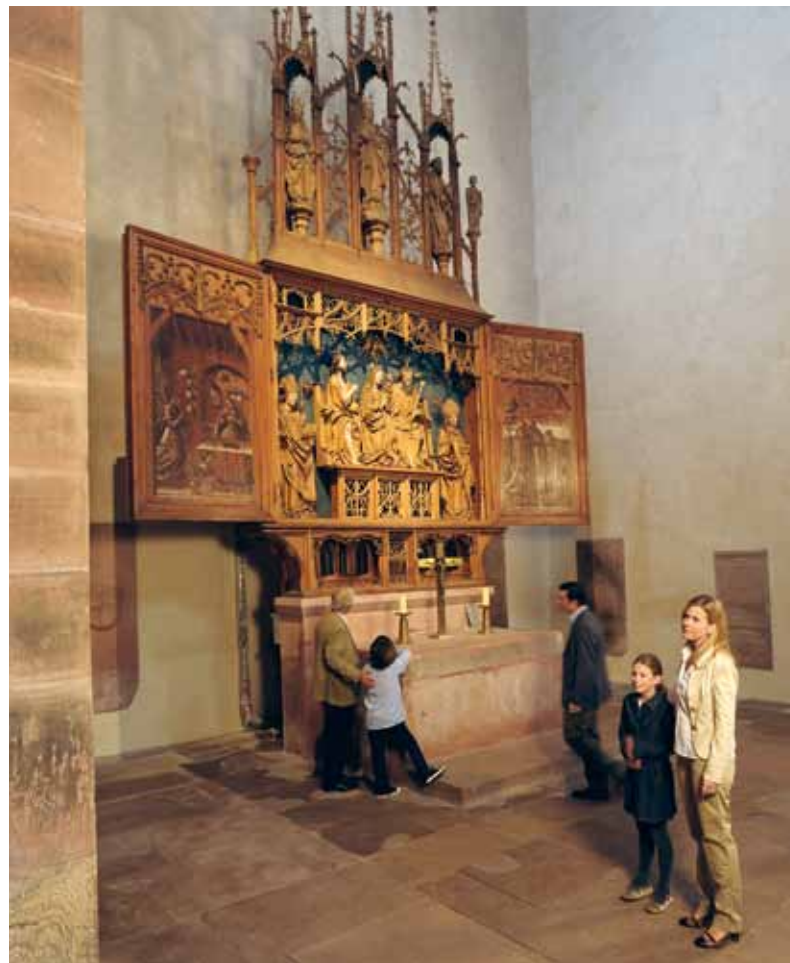
🏰 A late Gothic masterpiece in the monastery church: the intricately carved Marienaltar

(monastery church), is a three-nave columned basilica with a cross-shaped floorplan. The tympanum, or decoration between the arch and lintel, over the portal of the monastery church is an outstanding example of 12th century Romanesque sculpture. Two skilfully crafted bronze handles, in the shape of stylised lions' heads , embellish the doors. The church's double-storey chancel is a further unique feature.