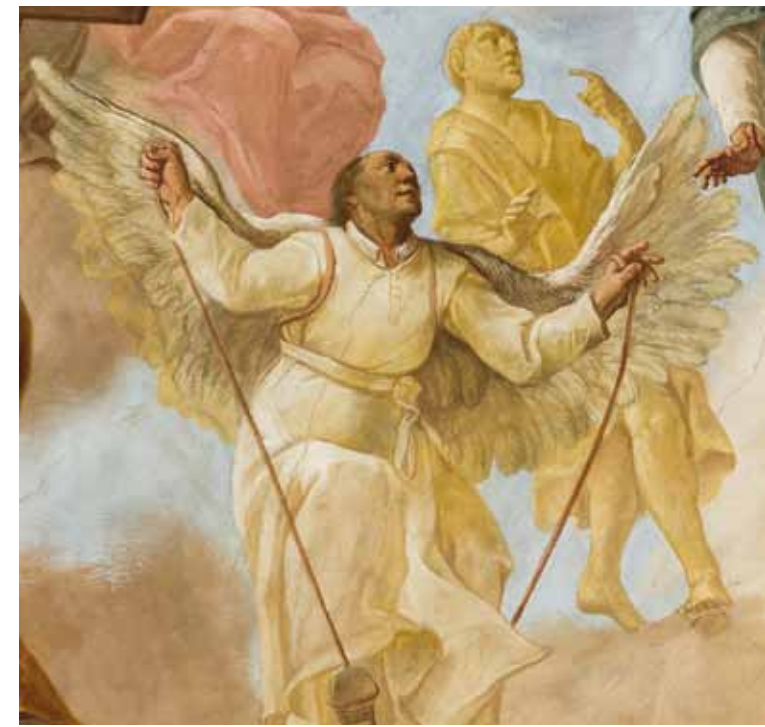
🏰 Schussenried’s most famous son: Caspar Mohr, the canon depicted in the library ceiling fresco, almost became a pioneer of aviation.

The best-known image from the fresco shows the enterprising canon Caspar Mohr. In the 17th century, he constructed a feathered flying machine, almost becoming the aviation pioneer of Upper Swabia – generations before the Zeppelin airship was invented.