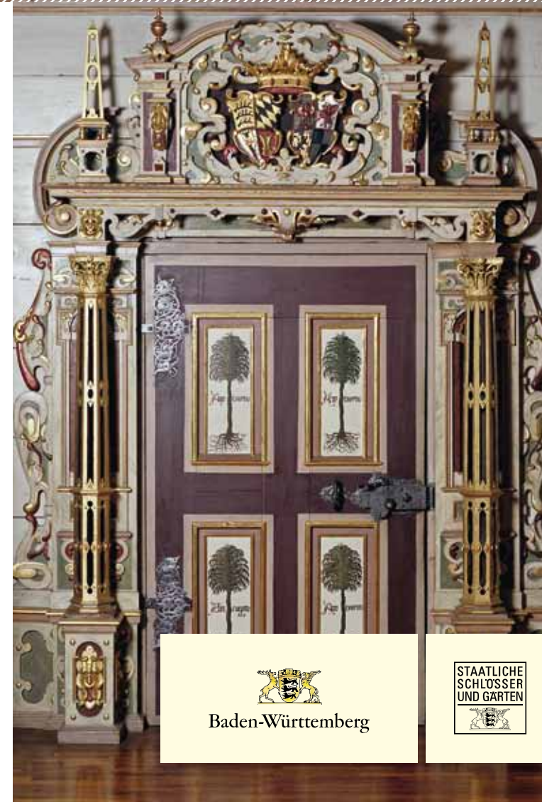
concept and design: www.jungkommunikation.de