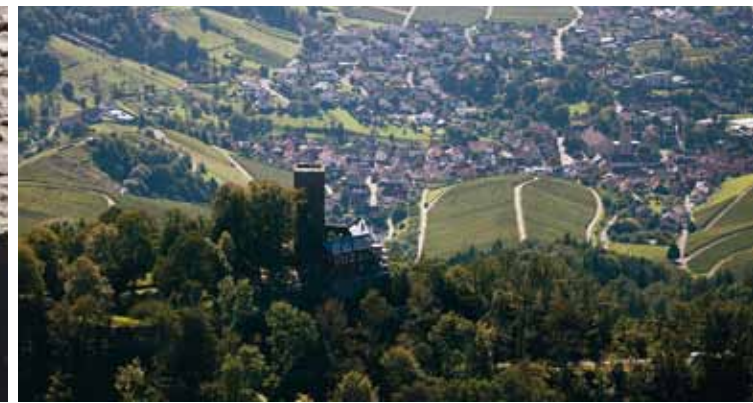
🏰 With a position like this, it is not surprising that Yburg Castle is popular with sightseers