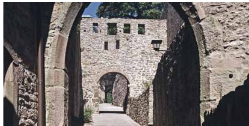
🏰 The Gothic style gateway of the lower castle takes you to the original Hohenbaden Old Castle, the Oberburg