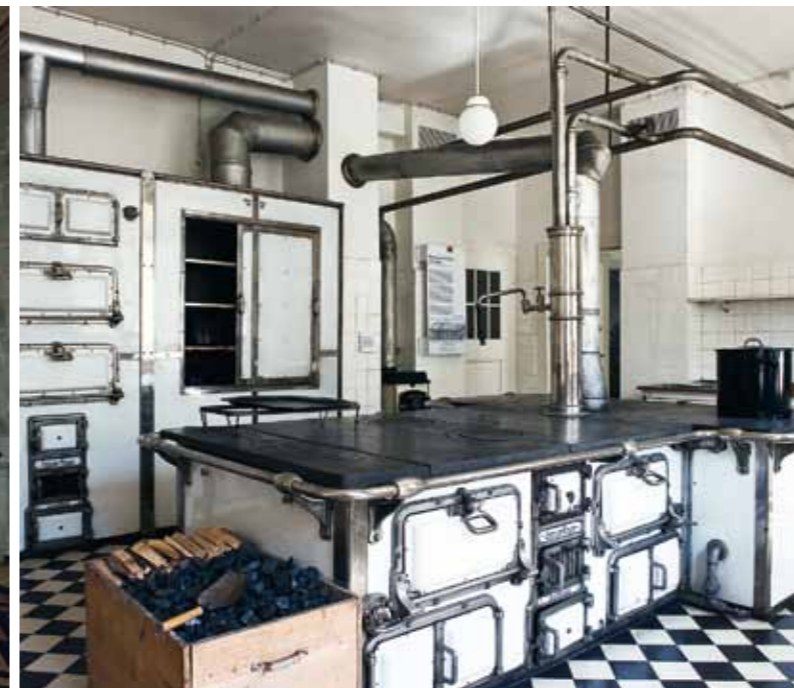
👑 The kitchen, built for the last royals of Württemberg, is still in the palace

The 19th century interiors, inspired by the Gothic and Renaissance styles, make Bebenhausen an important architectural heritage site. But the Grüne Saal (green room) has a distinct Art Nouveau character. After Württemberg ceased to be a monarchy in 1918, the royal couple, Wilhelm II and Charlotte, were given the right to remain in Bebenhausen for the rest of their lives. The royal bathroom and kitchen are well worth seeing: the luxurious bathroom, dating from 1915 , is unusually well preserved. The kitchen also represented the height of modernity when it was installed in 1915 – and still works today.