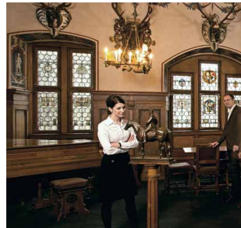
👑 Hunting is a recurring theme in the palace decor: pictured here, the Blauer Saal (blue room)

Attractively set in a peaceful valley, Bebenhausen Monastery is one of the best-preserved Cistercian abbeys in southern Germany. Founded between 1180 and 1183 by Rudolf, Count Palatine of Tübingen, the abbey was taken over by Cistercians a few years later – and promptly developed into one of the wealthiest monasteries in the region. After the Reformation swept through in 1534, and a boarding school was established in 1560, the number of monks dwindled, until the monastery was finally dissolved in 1684.