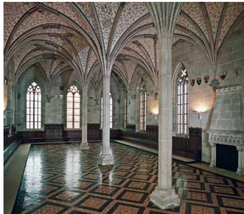
🏰 The summer refectory, where the monks dined in the warmer seasons, presents Gothic architecture at its most elegant

🏰👑 Personal touches: Queen Charlotte and King Wilhelm II lived here in seclusion