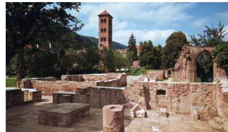
🏰 The Eulenturm, a Romanesque church tower, with its enigmatic statues, merits closer inspection

Today, the former monastery complex is a beautiful but atmospheric place, with the striking Romanesque and Gothic ruins set against the scenic backdrop of the Black Forest. Rising above the landscape, the 37-metre high Eulenturm (owls' tower) features a frieze of mysterious figures. The late Gothic Marienkirche (church of St Mary) and an assortment of monastic buildings offer a glimpse into everyday life at an abbey that was once one of the most influential spiritual and economic centres of the region.