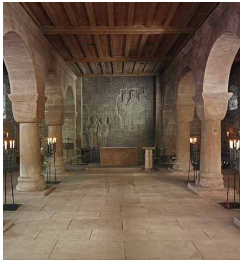
🏰 The Aureliuskirche (church of St Aurelius) recalls the once-majestic proportions of the monastery's Romanesque buildings

The first monastery in Hirsau was consecrated in 838. The Monastery of St Aurelius was built in 1059, on the foundations of the original structure. In 1082, construction of the Monastery of St Peter and Paul began, on the opposite bank of the Nagold River.