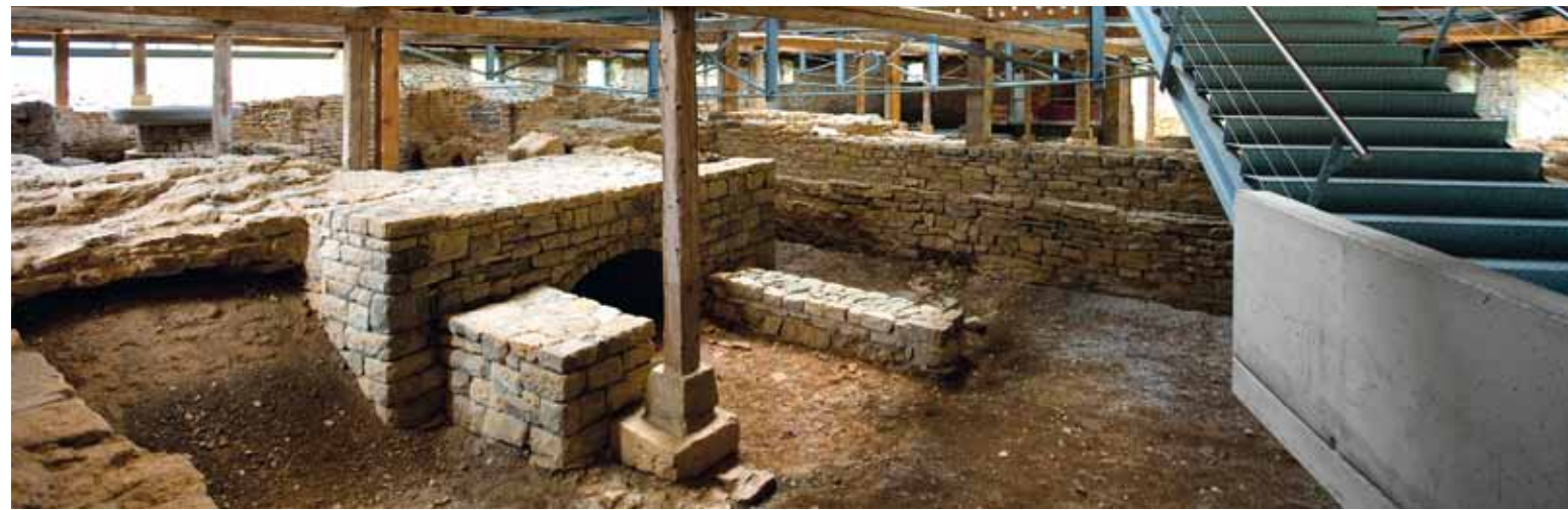
❖ Easily recognisable from its characteristic walls: the various rooms of the Roman baths

The Roman baths in Hüfingen are slightly west of the fortress, situated in a valley beneath Galgenberg hill. Not long after their construction, members of the public from the nearby settlement began paying a small fee to come and enjoy the hot waters and steam baths alongside Roman soldiers. A hypocaust , an ingenious Roman underground heating system, ensured the water was warm and kept the floors and walls at an agreeable temperature.