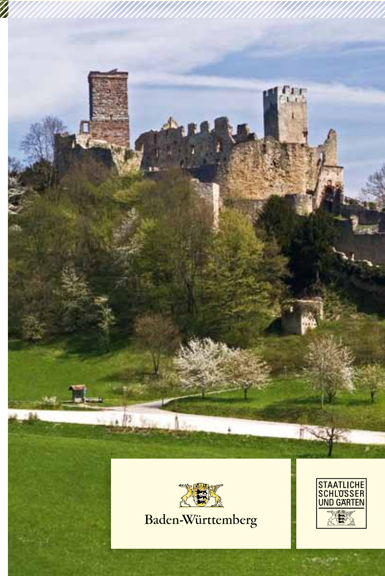
concept and design: www.jungkommunikation.de