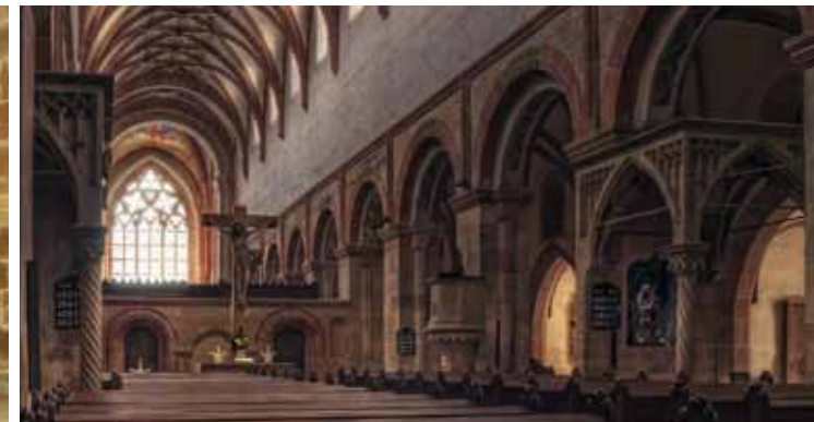
🏰 Romanesque arcades, Gothic roof: the monastery church illustrates the transition between different architectural styles

After being named a UNESCO World Heritage site, the monastery complex has become a world-famous landmark, attracting tourists from around the globe. It also serves as a concert venue, giving visitors the opportunity to appreciate the buildings' out-of-the-ordinary acoustics.