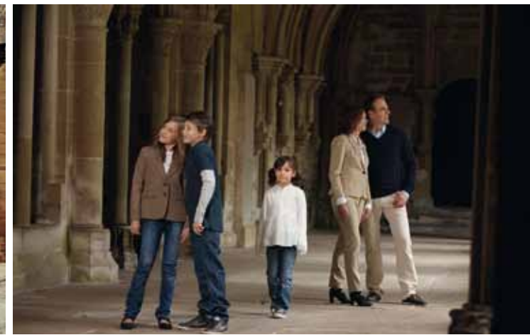
🏰 The cloister's late Gothic vaulted ceiling features a variety of intricate details

prominent scientists and writers including Johannes Kepler, Friedrich Hölderlin and Hermann Hesse . The school still exists, but is called today Evangelical theological seminary.