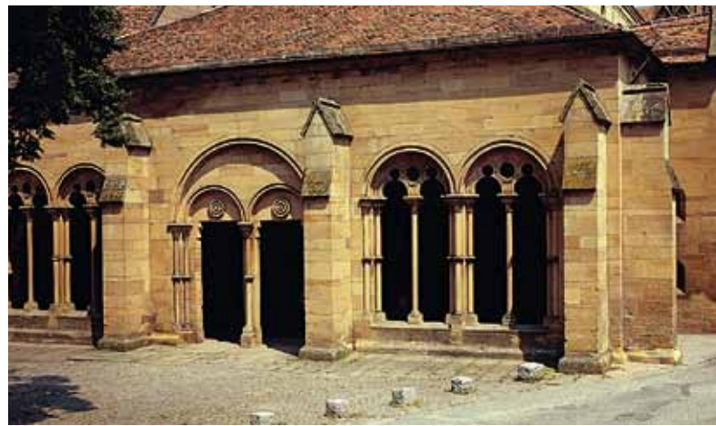
🏰 The monastery church's entrance hall, known as Paradies, is a masterpiece of early Gothic architecture

The monastery church's entrance hall, the Paradies , takes its name from the custom of painting church vestibules' walls with scenes from the Fall of Man. In Maulbronn, the last painting was completed in 1522. However, little of this work of art remains visible. The Paradies , the cloister's south wing, and the monks' refectory were constructed in the late Romanesque, transitional early Gothic style . These structures played a vital role in spreading the Gothic architectural style throughout German-speaking Europe.