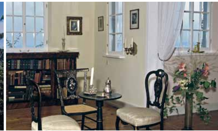
💎 Furniture, pictures and personal items breathe life into the world of the poet

The rooms of the museum have been carefully and lovingly decorated in a special way that provides an insight into the life of a noble woman and enable visitors to pay the famous poet a personal visit. The guided tours of the museum vividly bring the Annette von Droste-Hülshoff's home environment back to life and contain a special highlight: a performance on the fortepiano. After all, Droste-Hülshoff was not only a talented poet, but also a keen musician.