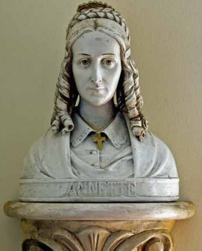
concept and design: www.jungkommunikation.de