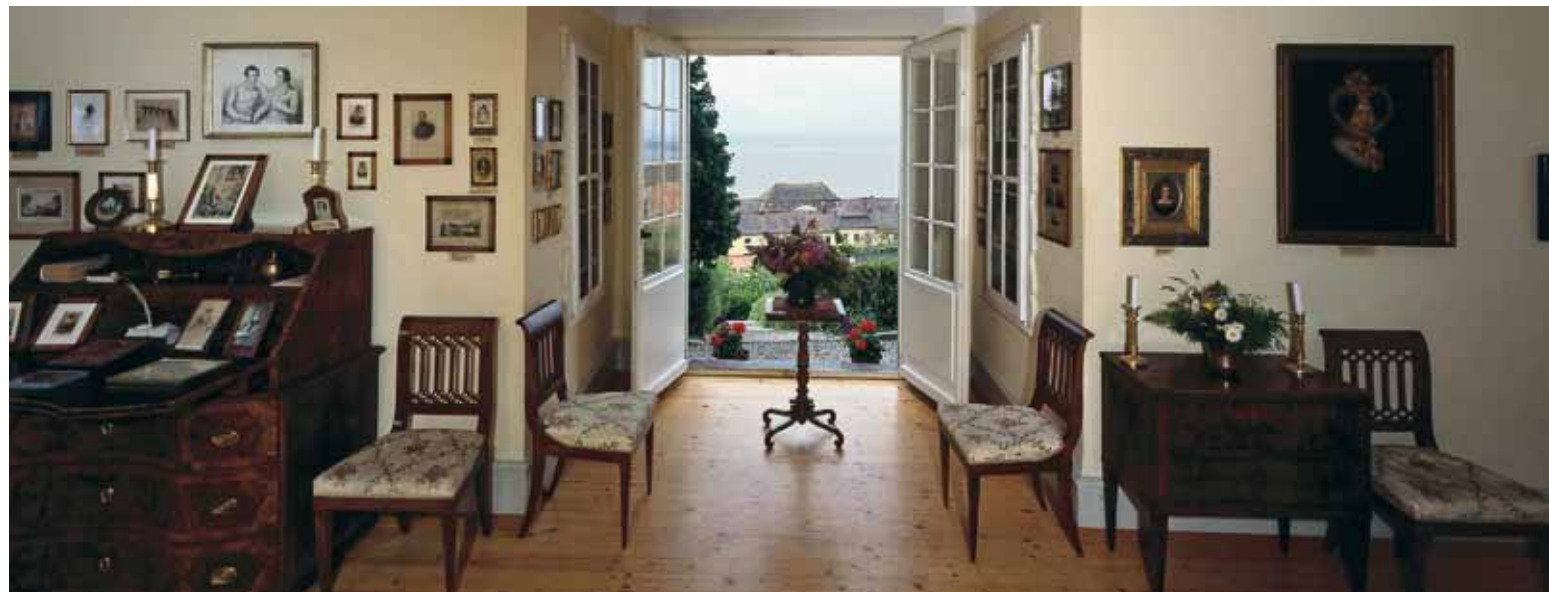
💎 The view of the lake is spectacular – and unchanged since Droste-Hülshoff's time

The rooms of the museum have been carefully and lovingly decorated in a special way that provides an insight into the life of a noble woman and enable visitors to pay the famous poet a personal visit. The guided tours of the museum vividly bring the Annette von Droste-Hülshoff's home environment back to life and contain a special highlight: a performance on the fortepiano. After all, Droste-Hülshoff was not only a talented poet, but also a keen musician.