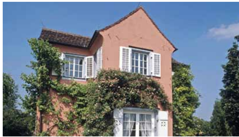
💎 Idyllically situated in the vineyards, the Prince's Little House was once the property of the Prince-Bishops

Droste-Hülshoff's heirs had the cottage converted into a memorial in 1923. The museum's highlights include manuscripts, handwritten texts, early and first editions of her poems and personal possessions, such as jewellery and porcelain. It is also home to Droste-Hülshoff's Biedermeier writing desk, birthplace of many of her literary works. The lovingly decorated rooms convey a vivid image of life in the Biedermeier era , and offer a private, behind-the-scenes glimpse at the famous poet.