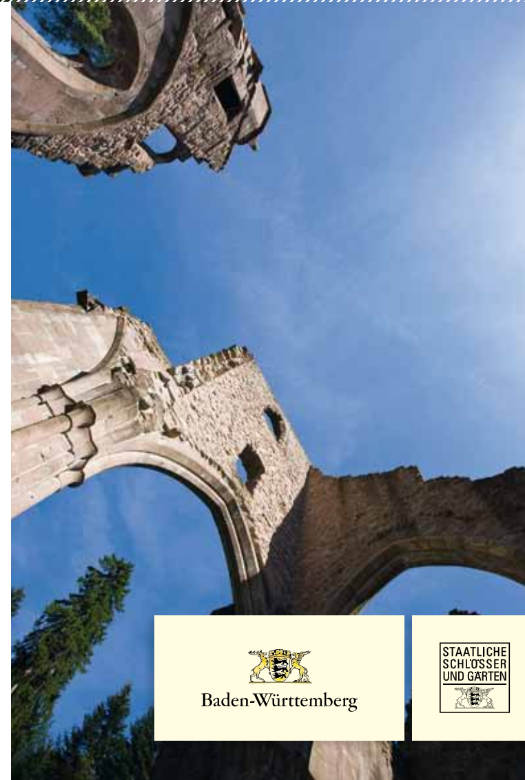
concept and design: www.jungkommunikation.de