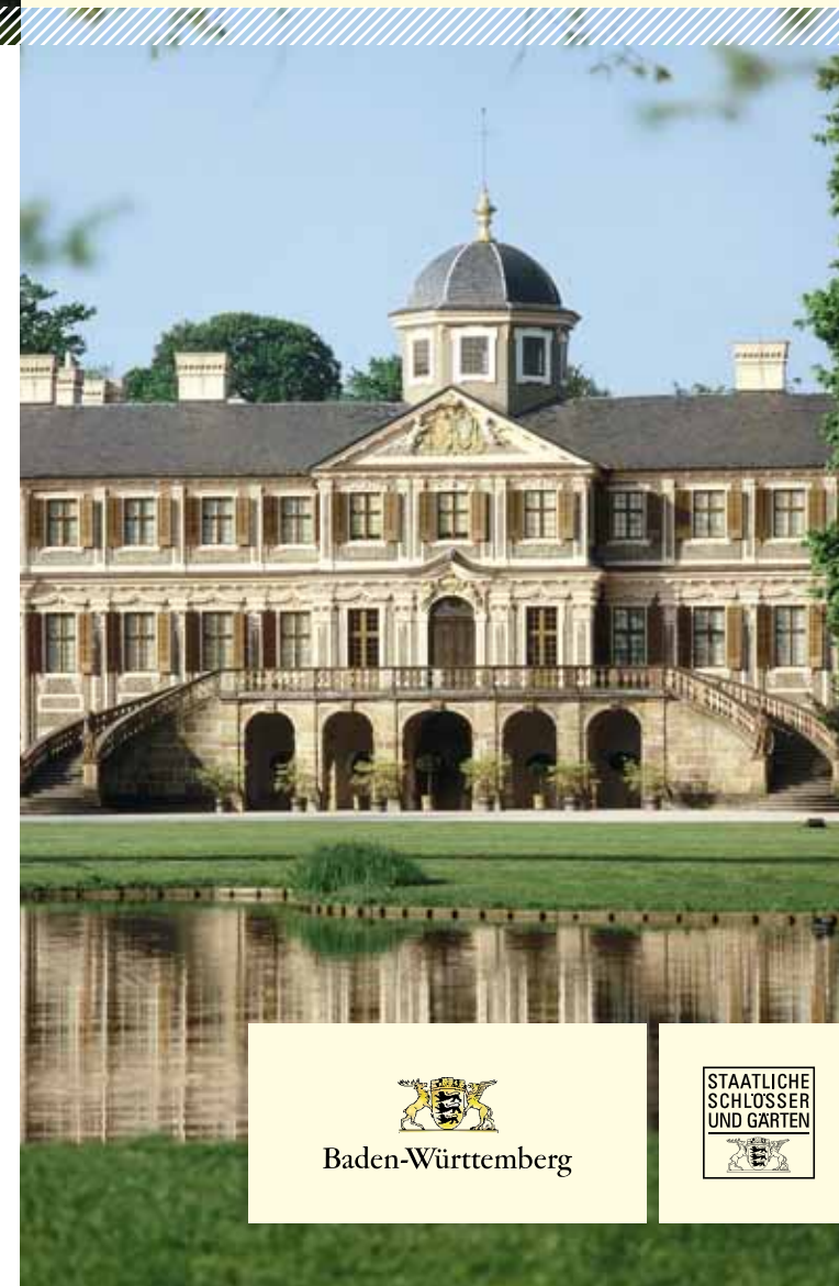
concept and design: www.jungkommunikation.de