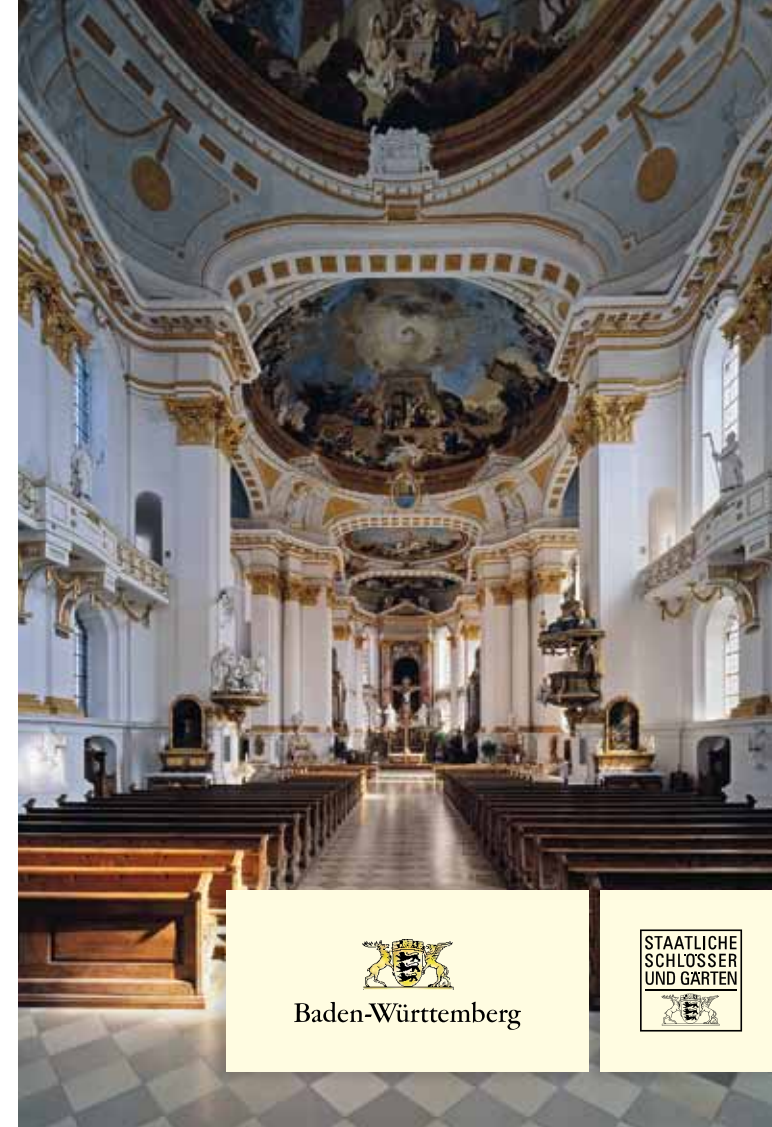
concept & design: www.jungkommunikation.de