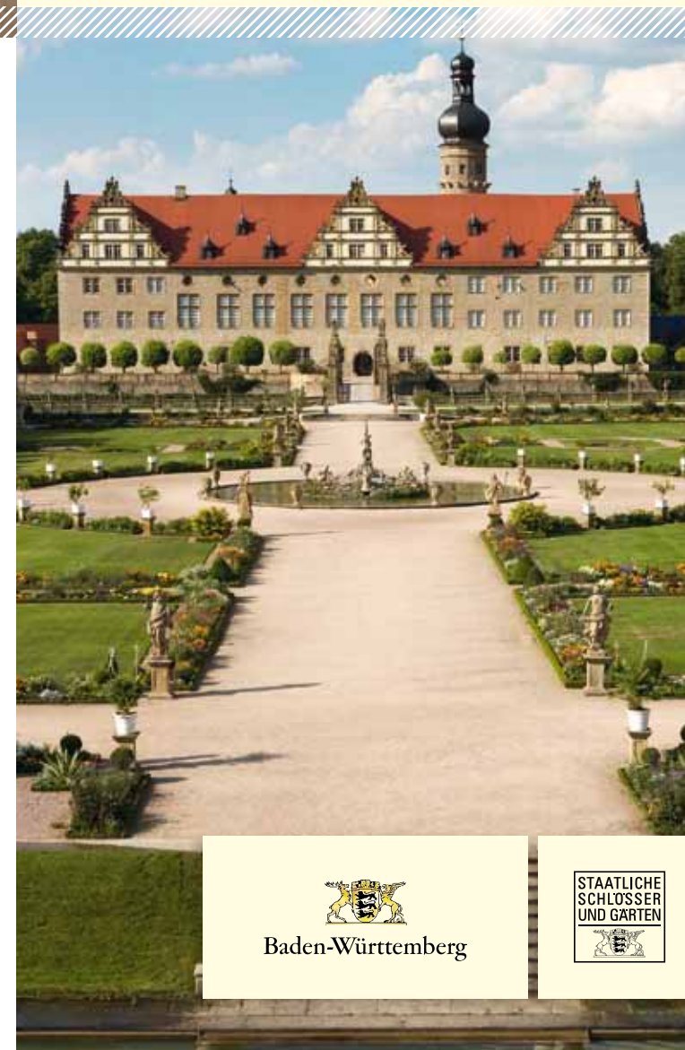
concept and design: www.jungkommunikation.de