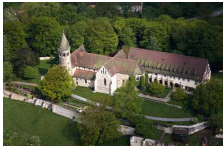
🏰 Visible from near and far, Lorch Monastery chapel nestles on a hilltop, making it a superb vantage point

The information centre at the foot of Hohenstaufen provides details on the Staufer line, including their origin and homeland, and the portrayal of this powerful dynasty.