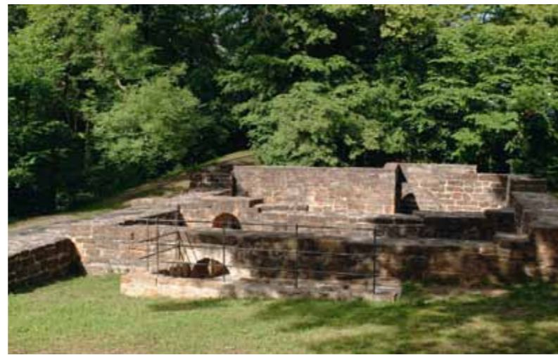
🏰 Only the foundation walls remain of what was once an important castle on the Hohenstaufen hill

W äserschloss Castle ( Burg Wäserschloss ), Hohenstaufen and Lorch Monastery ( Kloster Lorch ) are key historical locations for the Staufer – representing the birthplace of the dynasty, the official family seat, and its initial burial site.