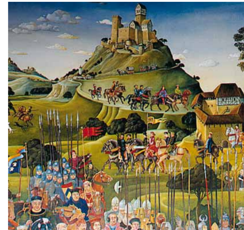
The well-known Staufer mural in Lorch Monastery depicts the colourful history of the house of Hohenstaufen

The homelands of the house of Hohenstaufen (who are also known as the Staufer) stretched from Göppingen to Schwäbisch Gmünd. This legendary medieval dynasty, which included dukes, kings and emperors, erected the first castles and monasteries in this area – and soon wielded powerful influence over central Europe and the entire Mediterranean region.