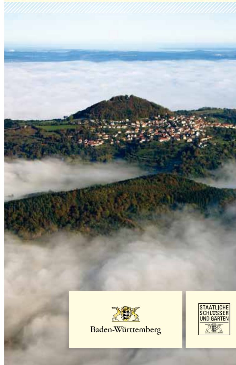
concept and design: www.fungkommunikation.de